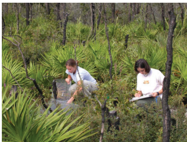
Fig. 1. Narrow central Florida scrub endemic Ziziphus celata , protected from herbivory by cages at an introduction site, being monitored for growth and survival. Introduced populations are being designed with propagules from multiple wild populations in order to overcome breeding-system limitations imposed by cross-incompatibility and limited genetic variation (Weekley et al. 2002).

A key qualitative measure of the ultimate fate of translocations is the ability of transplants to flower and set fruit, often considered a