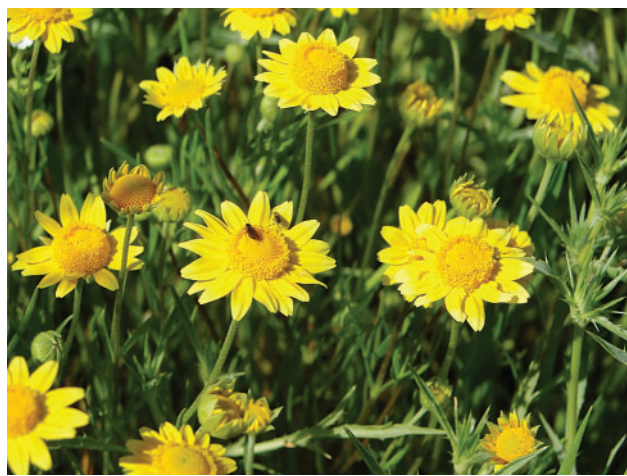
Fig. 4. Vernal pool endemic composite Lasthenia conjugens . Introductions of this species have levels of genetic variation similar to those of wild populations (Ramp et al. 2006).

The success of translocations is, of course, dependent on context and on events that occur during the translocation. In many translocations, these factors vary stochastically among sites