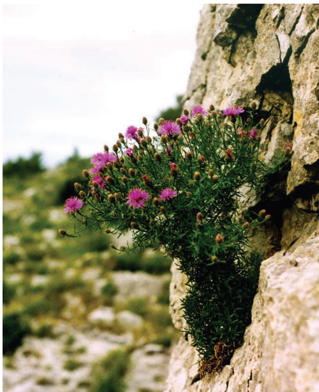
Fig. 3. Flowering individual of the narrow endemic Centaurea corymbosa growing in limestone outcrops in southern France. Multiple introductions from many source populations were most successful in creating new populations (Kirchner et al. 2006).

Close tracking of plants inherent in collecting data for a population viability analysis allows comparisons of potential population growth with and without translocations. The analysis of the endangered palm Pseudophoenix sargentii in the Florida Keys showed that reintroduced plants had faster maturation and higher population growth rates than did wild plants and that reintroductions have expanded the species range (Maschinski and Duquesnel 2007).