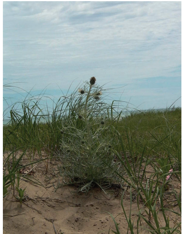
Fig. 2. Cirsium pitcheri flowering plant translocated into a restoration site in Wisconsin, USA. Introduced populations of Pitcher's thistle show a similar range of vital rates, but greater variation in these rates, than wild populations (Bell et al. 2003).

The first population viability analysis on an introduced population was accomplished by Bell et al. (2003) on Pitcher's thistle ( Cirsium pitcheri ; Fig. 2), an endemic monocarpic perennial herb that grows on sand dunes of the western Great Lakes in North America. Repeated introductions into protected land near Chicago were closely followed to obtain demographic data for transplants and naturally recruited individuals. Data on these two groups showed different